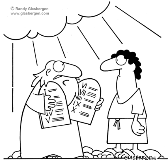
"I downloaded them from a cloud."

The Men's Group will meet again on Tuesday, Nov. 10 , at 7 p.m. in the basement of the church building.